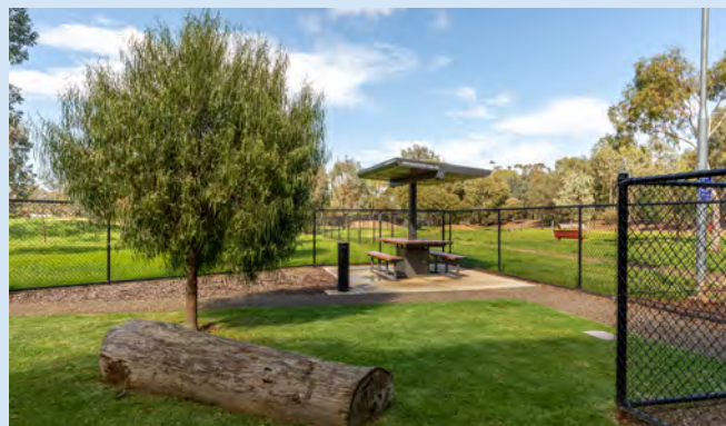
Small dog area at the Canterbury Drive Reserve dog park.