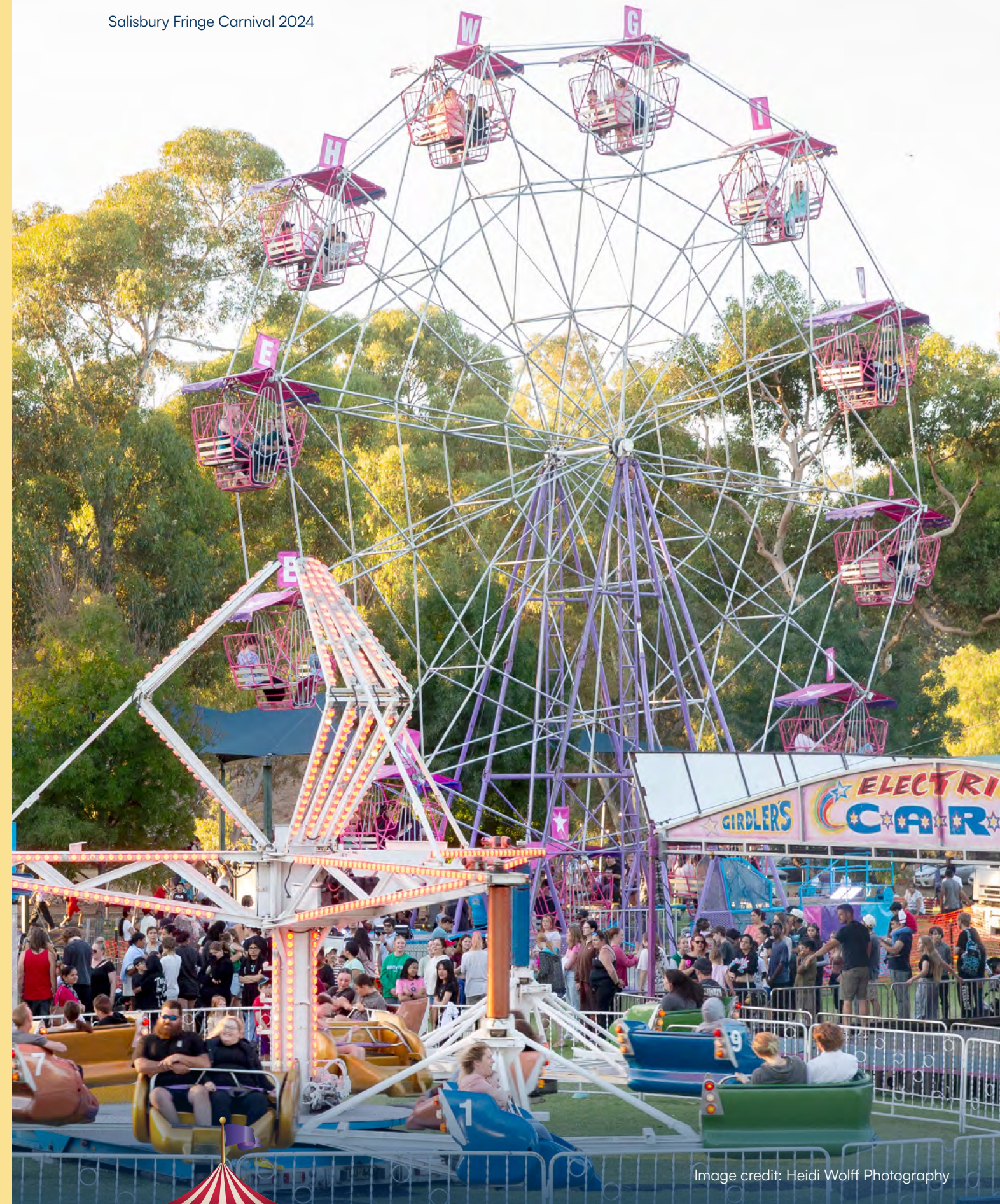
Salisbury Fringe Carnival 2024

1 June — Salisbury Community Fun Day Ingle Farm Recreation Centre