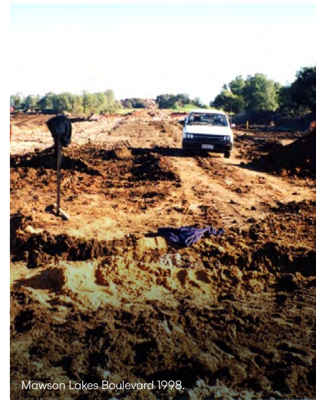
Mawson Lakes Boulevard 1998.