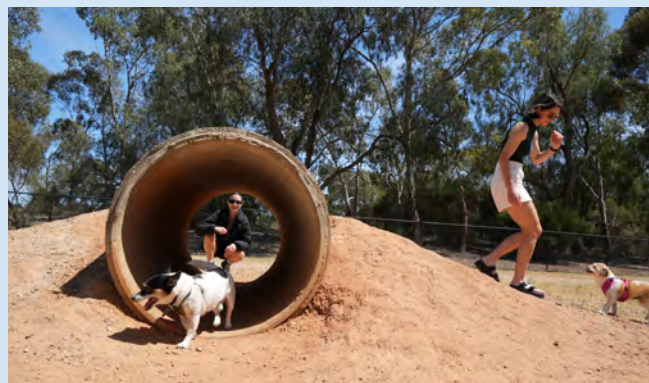
Main area at the Canterbury Drive Reserve dog park.