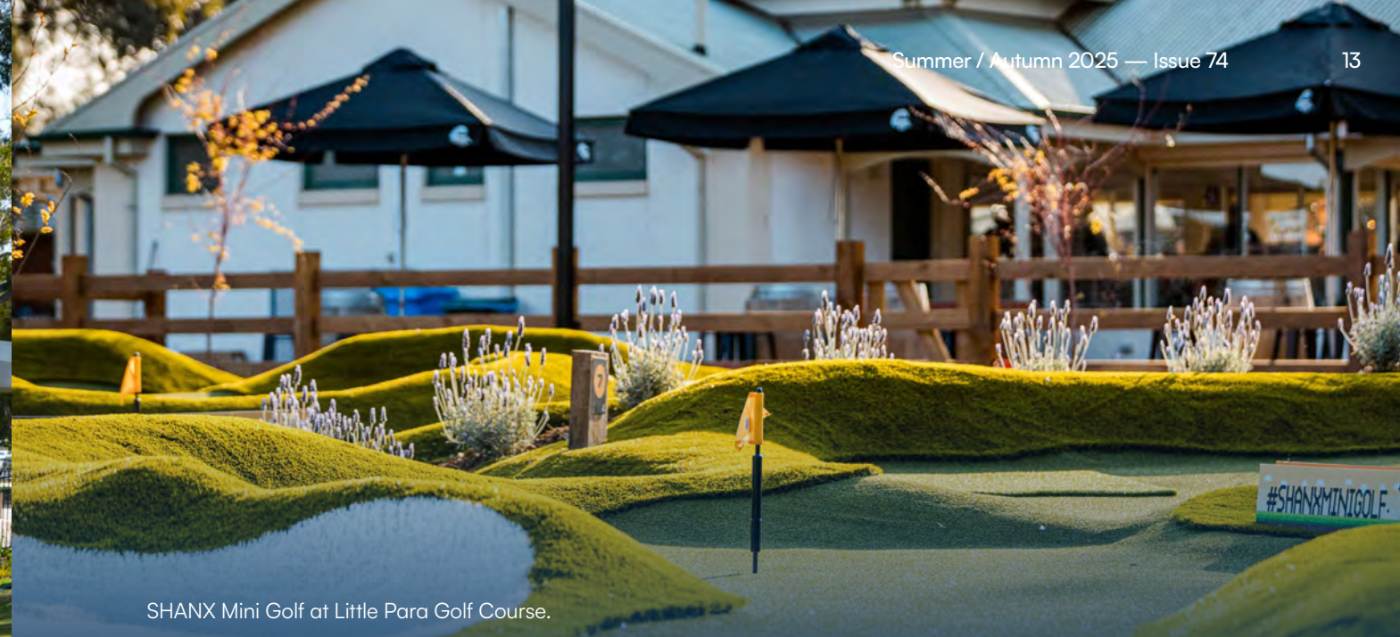
SHANX Mini Golf at Little Para Golf Course.

'Happy Home Reserve is now a complete hub for recreation, making it the perfect destination for a full day out.'