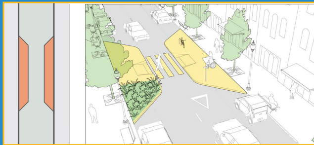
Proposed narrowed footpath crossing locations

The Streetscape Renewal Program aims to deliver enhancements to selected streets in the City of Salisbury that will enrich and beautify the City.