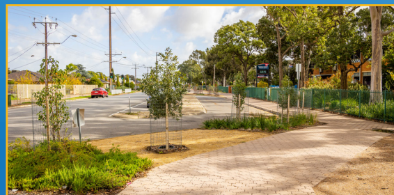
Street trees and rubble verge treatment