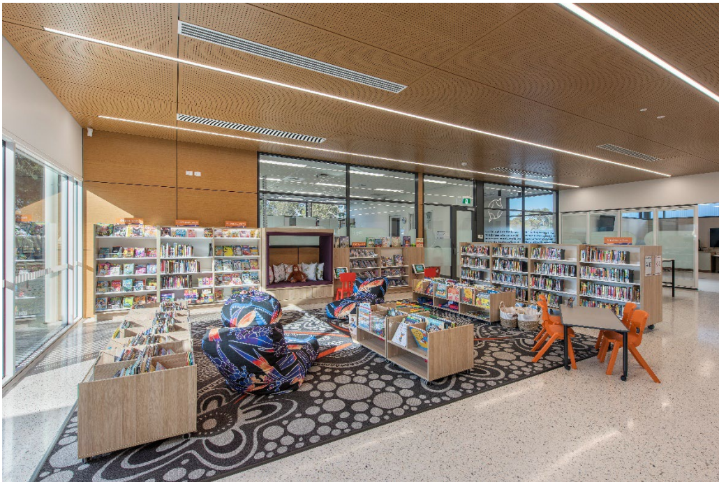
Children's Area, Burton Community Hub, 2023

The Manager Community Participation and Partnerships has delegated authority to vary Library fees for the purpose of introducing new programs and / or allowing for increases in supply costs.