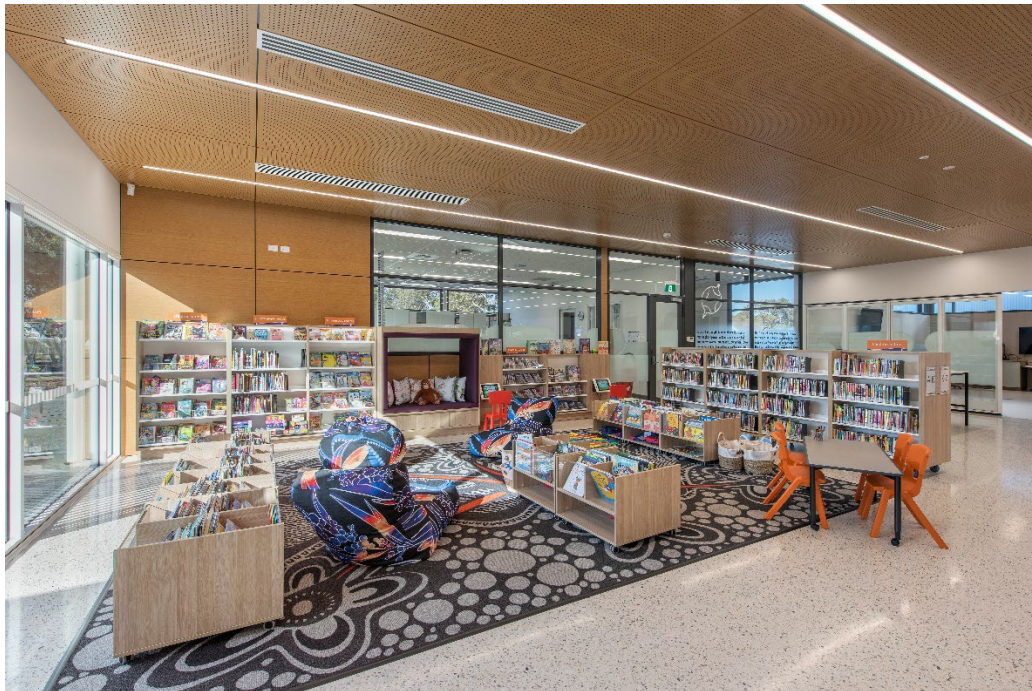
Children's Area, Burton Community Hub, 2023

The Manager Community Participation and Partnerships has delegated authority to vary Library fees for the purpose of introducing new programs and / or allowing for increases in supply costs.