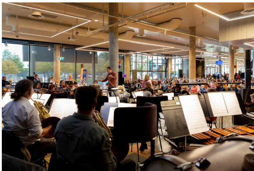
Adelaide Symphony Orchestra Concert, 2023

Located in the heart of Salisbury's central business district, the Salisbury Community Hub is a great place to hold your next meeting, workshop, seminar, convention or any other business or community related event. Offering a variety of flexible spaces and the latest technology, this site attracts a wide range of events including performances from the Adelaide Symphony Orchestra and a variety of Expos. The natural flow between the ground floor event space and the outdoor Salisbury Civic Plaza (Inparrintheta Kumangka) also provides an ideal space for larger community-based events. Built into the original design are also a range of spaces to showcase local and travelling exhibitions including wall and cabinet areas for hanging and displays.