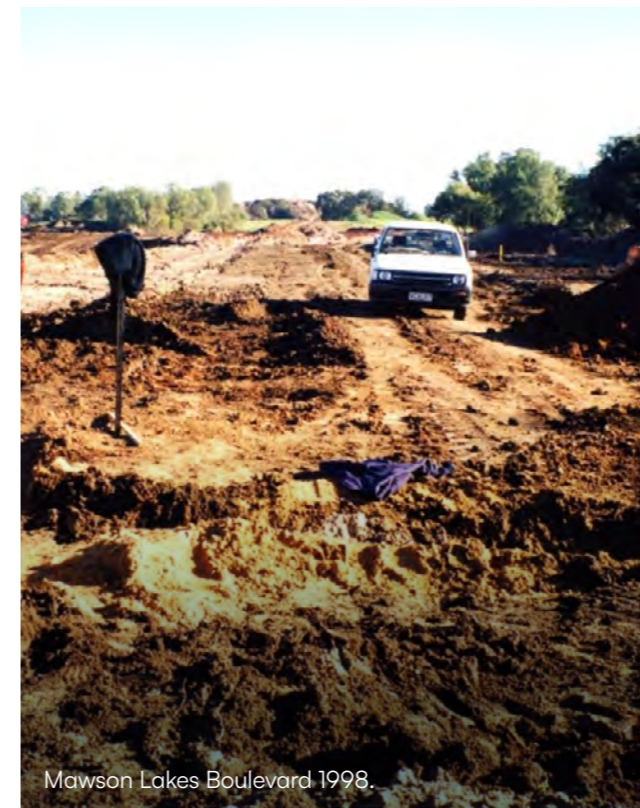
Mawson Lakes Boulevard 1998.