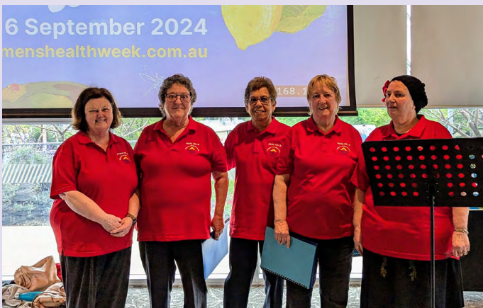
Para Hills Songsters at Women's Health event.