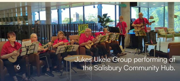
Jukes Ukele Group performing at the Salisbury Community Hub.

For more information contact JYC on 8406 8525.