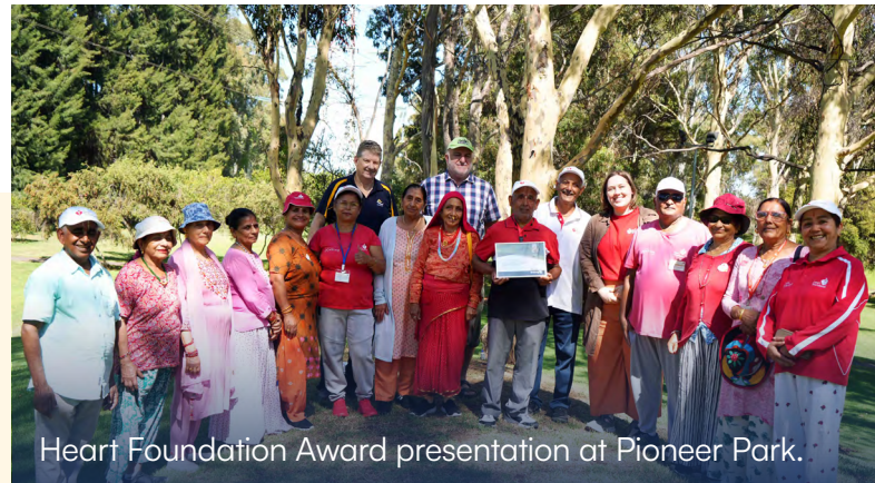
Heart Foundation Award presentation at Pioneer Park.

Since their formation over 10 years ago, the group has achieved extraordinary milestones, collectively walking millions of steps — equivalent to circling the globe!