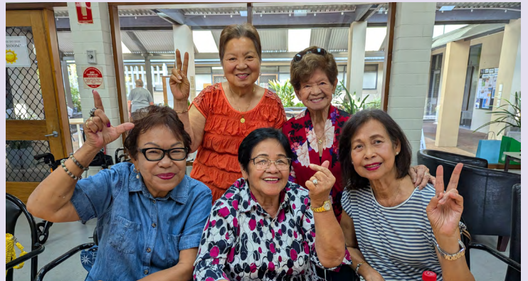
South East Asian group members at Jack Young Centre.