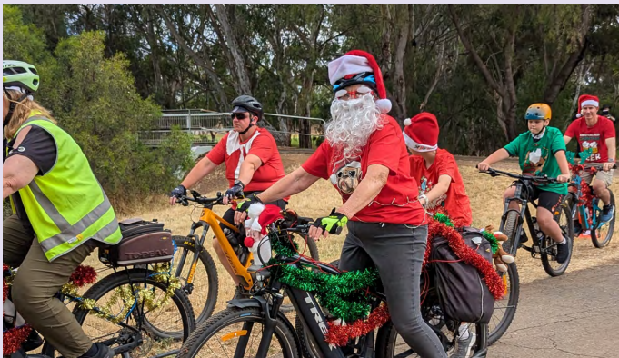
Cycle Salisbury participants at the Salisbury Community Christmas Parade.