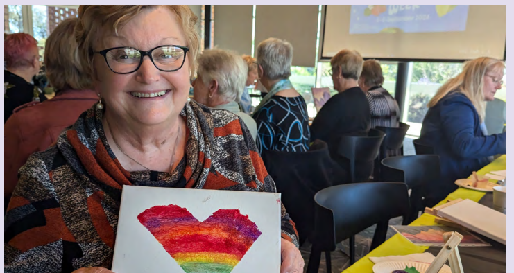
Sip and Paint event as part of Womens Health campaign.