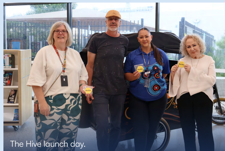
The Hive launch day.

For more information, contact on 8487 1820 or visit www.salisbury.sa.gov.au/hive