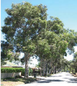
Spotted Gum Corymbia maculata

An evergreen tree, up to 20m in height, with a spreading canopy. It has smooth, spotted grey bark and clusters of large, white flowers that appear in winter.