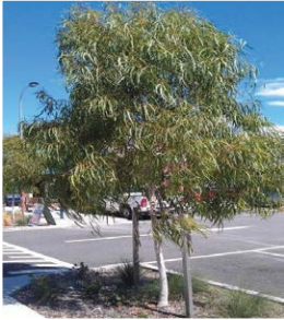
Dwarf Lemon-scented Gum Corymbia citriodora 'Scentuous'

A small evergreen tree up to 4m in height. It has narrow lemon scented leaves and cream coloured flowers in summer. This tree tolerates a range of soil and climatic conditions and is recommended for small verges and is approved for planting under powerlines.